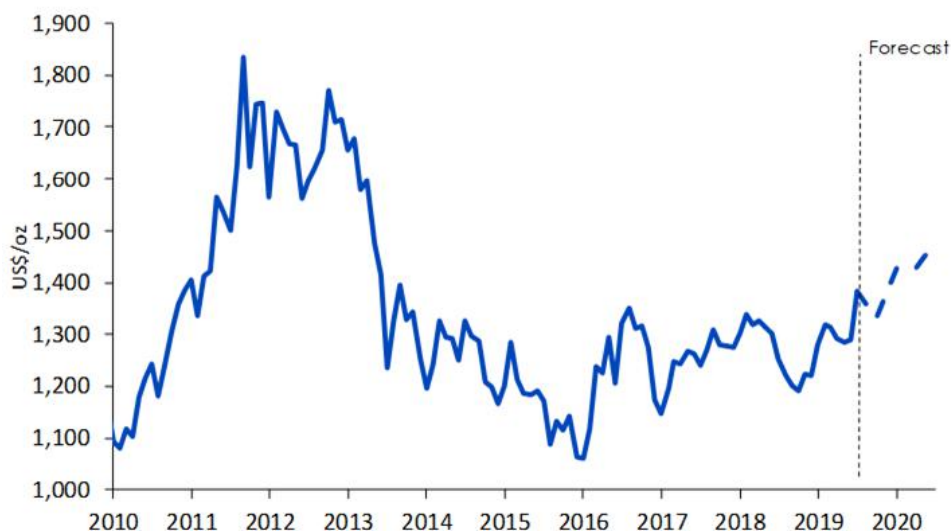
Figure 1: WisdomTree's gold price forecast