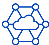
Quantum software and algorithm providers