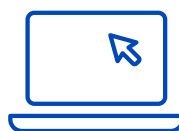
Quantum annealing and simulation providers