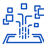
Advanced computing providers