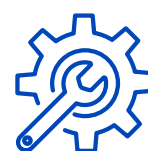
Providers of tools and infrastructure, semiconductors, materials, and components to companies involved in the development of quantum computing technologies

The selection and weighting of companies in the WisdomTree Quantum Computing UCITS ETF is a result of WisdomTree’s proprietary research into the quantum computing space and close collaboration with Classiq 4 – bringing unparalleled expertise and insights on key quantum computing players.