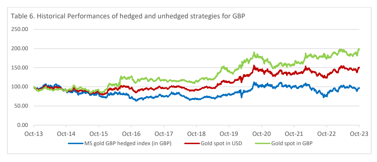
The Indices are the exclusive property of MS&Co. MS&Co and the MS&Co index names are service mark(s) of MS&Co or its Affiliates and have been licensed for use for certain purposes by the Issuer.