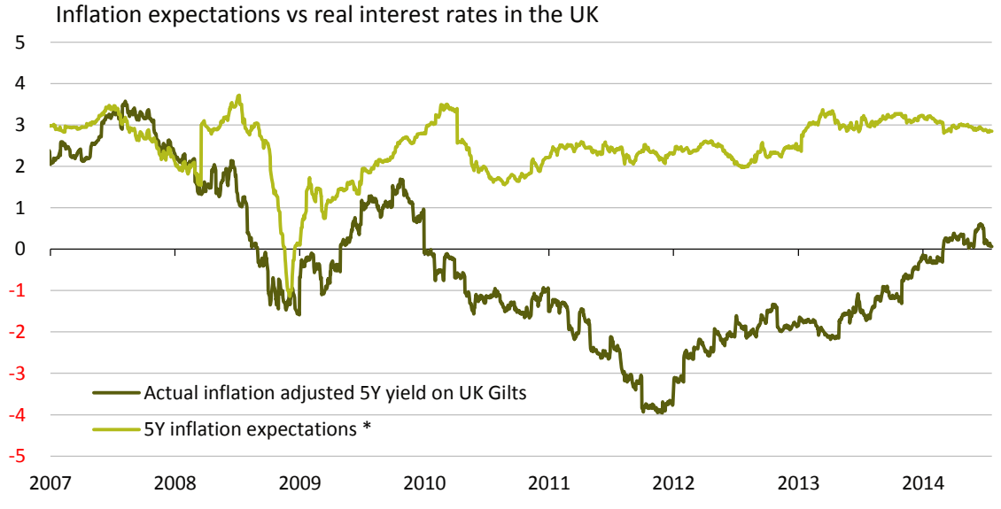
Chart 2: A Return of higher growth and higher inflation

Source: Boost ETP Research, Bank of England, Bloomberg. Data as at 18 July 2014 * 5-year yield differential between UK Gilts and UK Inflation-linked securities